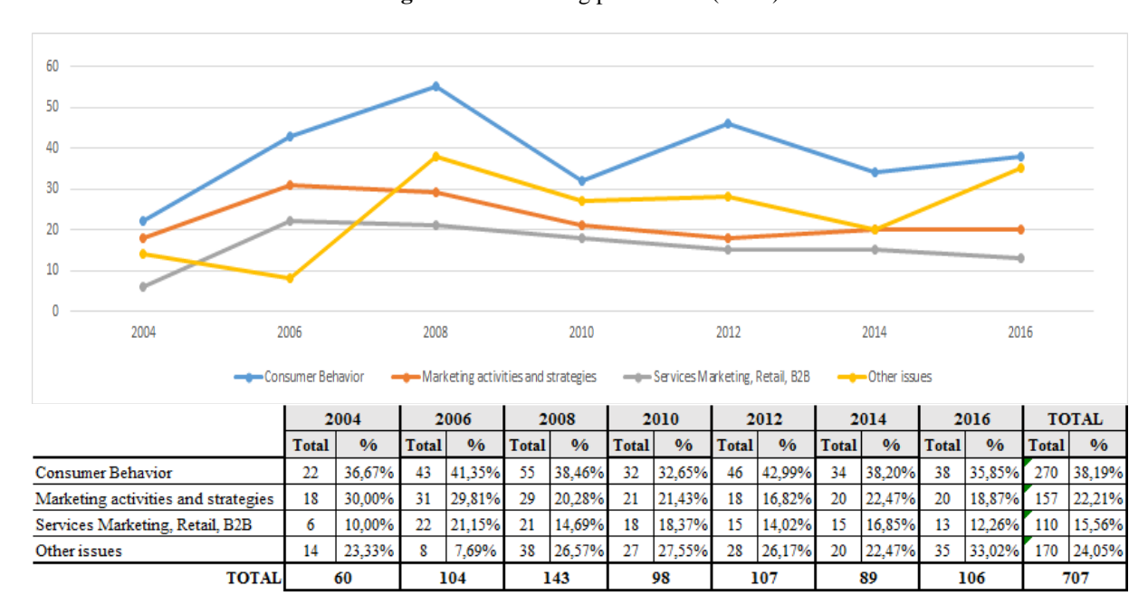
Figure 6 – Marketing publication (EMA)