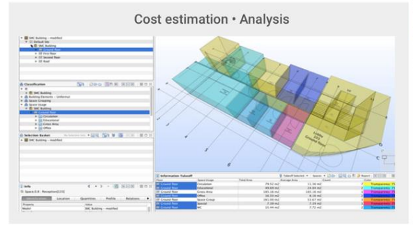
Figure 1b – BIM use in construction phase