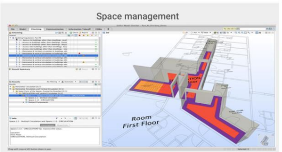
Figure 1a – BIM use in design phase