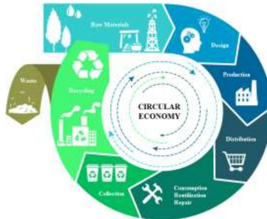
Figure 3 - Typical Sequential Process of a Circular Economy

The following figure shows a continuous process of reabsorption and recycling, based on the reduction, reuse, recovery, and recycling of materials and energy, as proclaimed in the principles of a more circular economy.