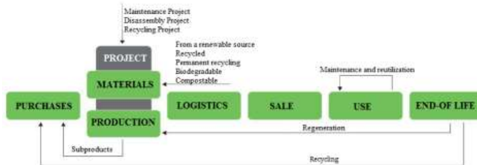
Figure 2 - Design process for the development of circular products