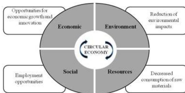
Figure 4 - Benefits of the circular economy