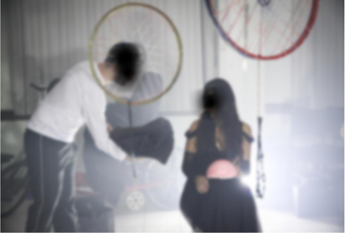
Figure 6 – A student hands a blanket to Guilty Conscience

in the play was that engineering is present in everything in our lives." This part of the play was probably influenced by the discussion cycle "Engineering from what you eat to what you shit".