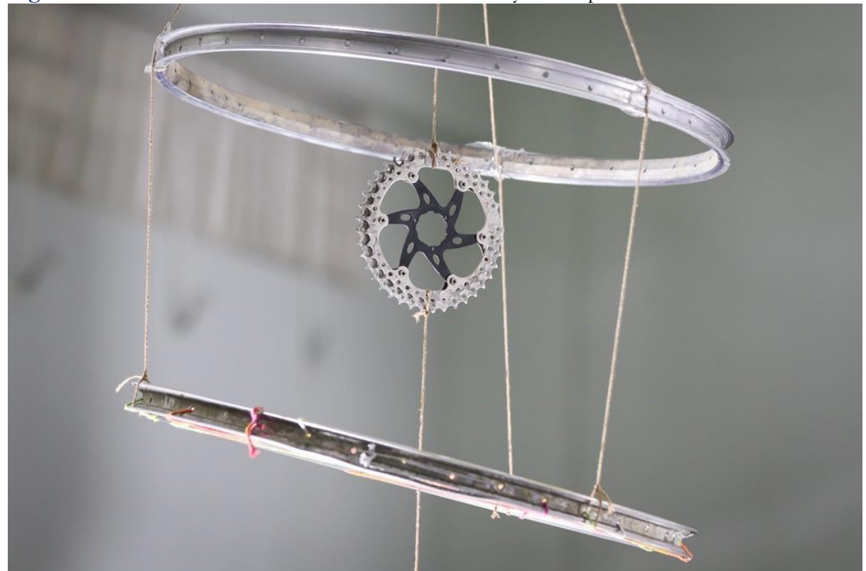
Figure 3 – Element from the scenario constructed with bicycle components

Moreover, they conceived a scenario to immerse the actors and the audience in a world built on machines. As Bernardo explains, "the scenario focused on the engineering course. It had several bicycle rims, tools, and other machine mechanisms." Carla remarks, "The scenario we created was impressive. I observed the audience astonished from the stage entrance." In Figure 3, we can observe an element from the scenario made up of cords and bicycle rims.